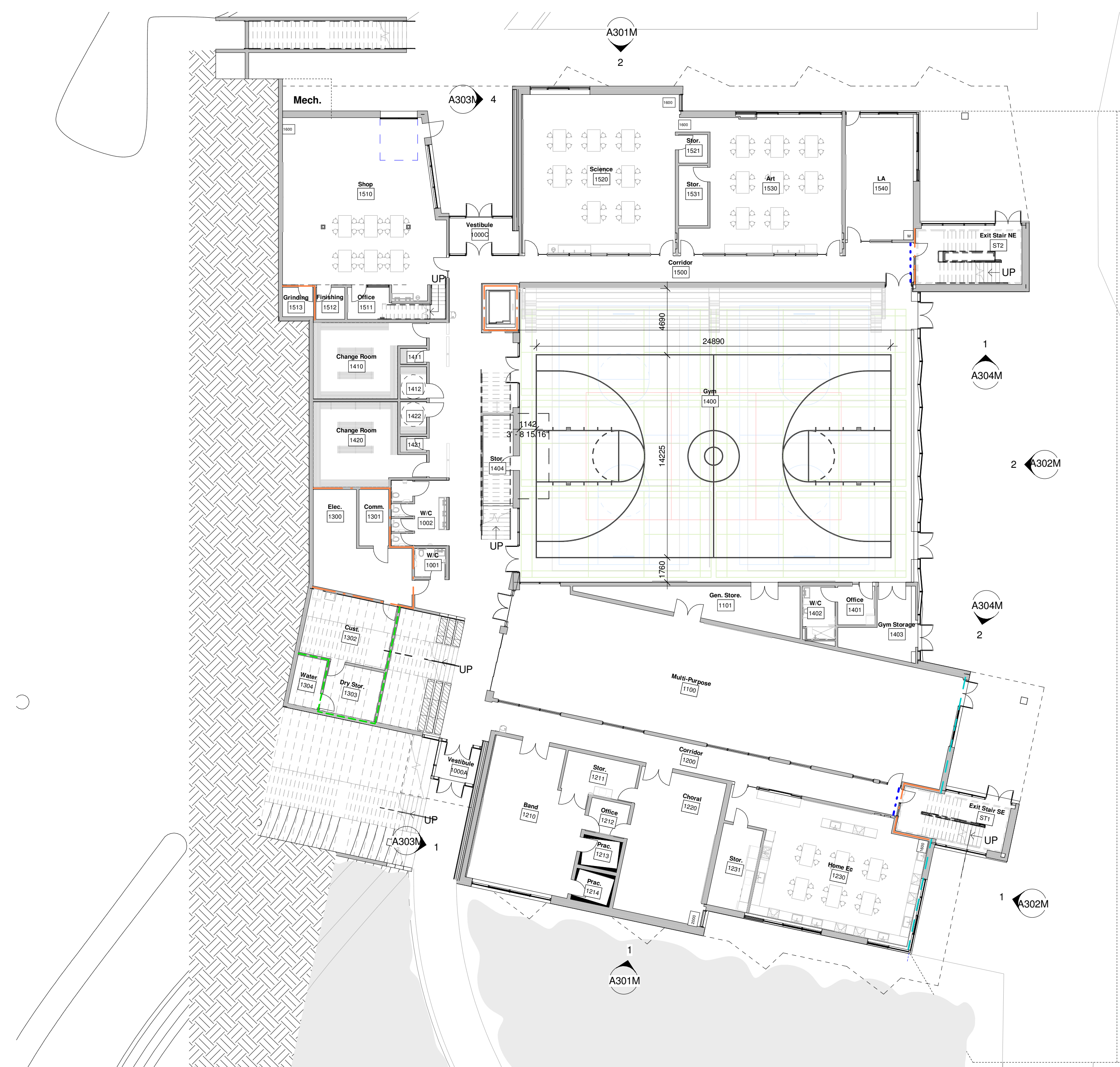
1 MS LEVEL 1 - KEY PLAN