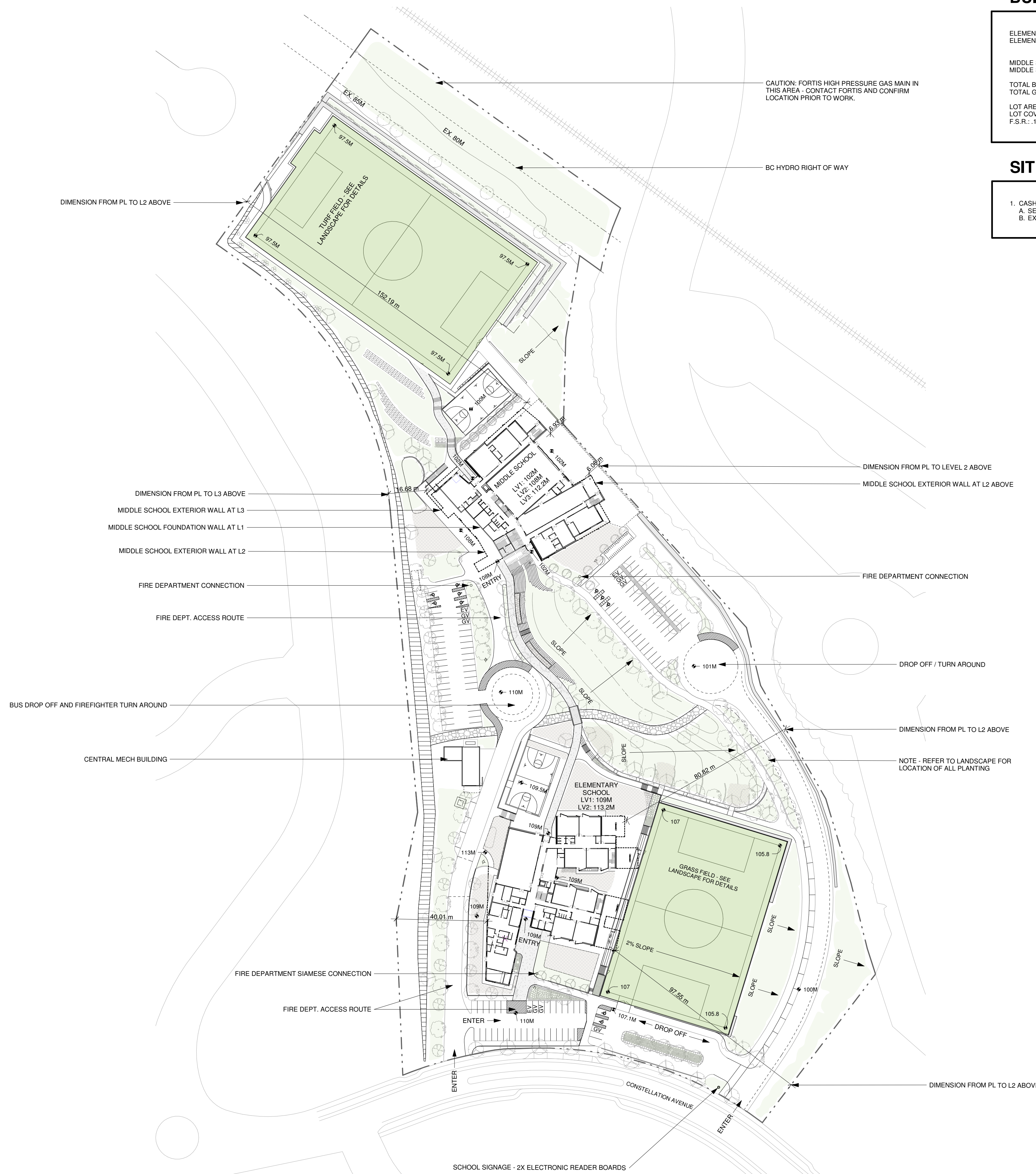
1 SITE PLAN 1 : 1000